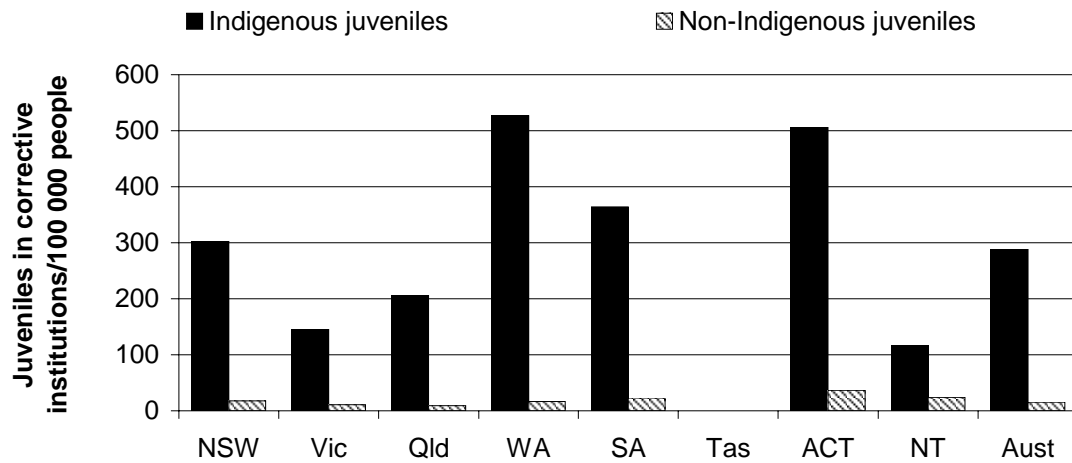
Figure F.3 Indigenous and non-Indigenous detention rates, 2001-02 a, b, c, d

a Jurisdictional comparisons need to be treated with caution, especially for those States and Territories with low Indigenous populations, where small number effects can introduce statistical variations that do not accurately represent trends over time or consistent differences from other jurisdictions. b Detention rate is based on the average population of juvenile corrective institutions on the last day of each quarter of the financial year. c A review of data provided by Tasmania indicates that discrepancies in the number of young people reported in the data may result in higher numbers reported than the actual numbers in the detention centre. The proclamation of the Tasmanian Youth Justice Act 1997 in February 2000 extended the upper range of the target group, resulting in an increased number of young people in detention. d ACT data for 2001-02 have been revised from data previously published by the AIC.