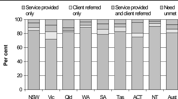
Support needs of SAAP clients, by met and unmet demand, 2001-02 (p. 15.51)