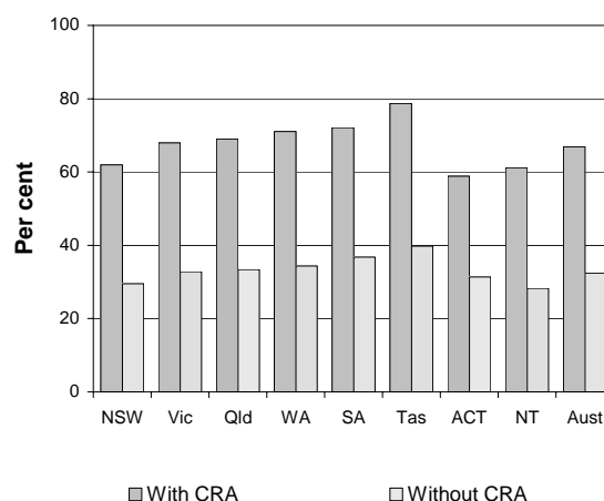
Recipients spending less than 30 per cent of income on housing with and without Commonwealth Rent Assistance, 30 November 2001 (p. 16.71)