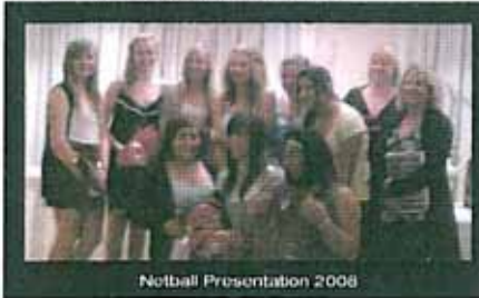
Netball Presentation 2008

At the time of writing we still have a vacant position to fill -Uniform and Equipment Officer. Anyone interested should contact our President or Secretary for further information.