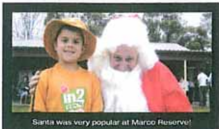
Santa was very popular at Marco Reserve!