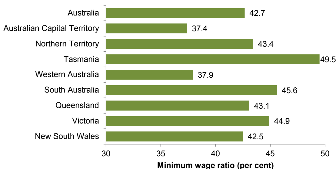
Figure 2.2 Minimum wages to average weekly wages By state, May 2014 a

a Based on the ratio of the adult Federal Minimum Wage to full time adult ordinary weekly cash earnings. Data source: ABS, Average Weekly Earnings, Australia , May 2014, Cat. No. 6302.0.