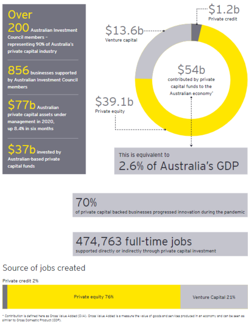
Figure 1: Private Capital’s Contribution to the Economy 3

Private capital encourages more evenly distributed access to funding, offering alternative non-bank sources of financing and organises the more efficient allocation of capital across the economy. It is the platform that allows good businesses to become great ones, all while providing stable, consistent employment to thousands of Australians today and helping create the high-growth sectors that will deliver the jobs of the future. The growth of Australia’s private capital sector is testament to the value it brings to our economy and society. The industry is thriving, with Australian private capital assets under management (AUM) totalling $90 billion in 2021, an increase of 11 per cent in the six months from December 2020.