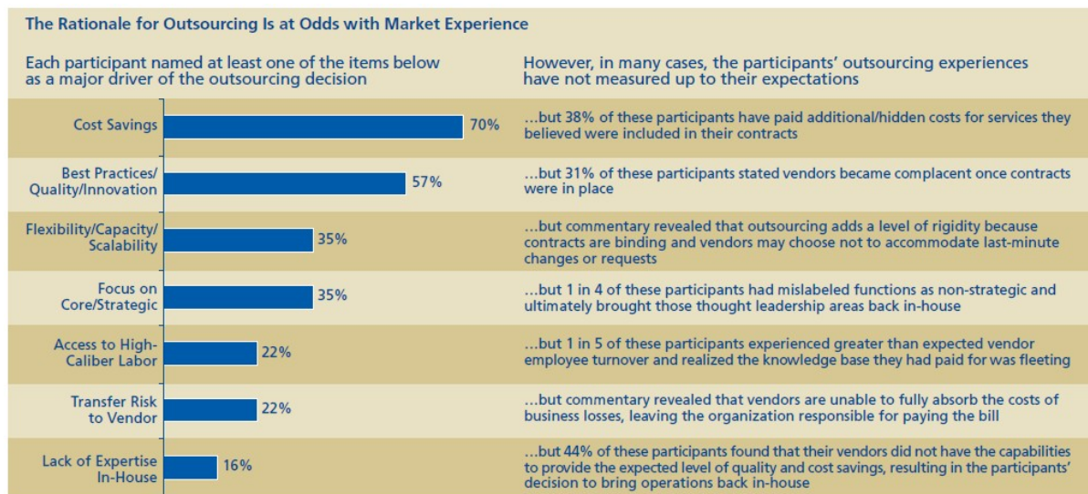
Figure 1: outsourcing – expectations versus experience

b) Many corporations report similar types of problems: loss of power, skills and control to the vendor; unexpected costs and charges after contracts have been finalised; significant cost inflation if standardised processes are tailored to particular business needs; operational rigidity imposed by long service contracts; further sub-contracting by vendors that undermines service quality; lack of cost and performance transparency making the benefits of outsourcing difficult to quantify and the contracts difficult to manage; vendors become complacent about quality and targets once a contract is in place.