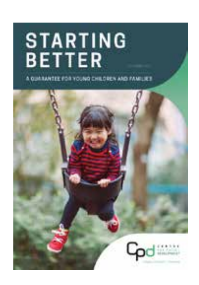
Read Starting Better here