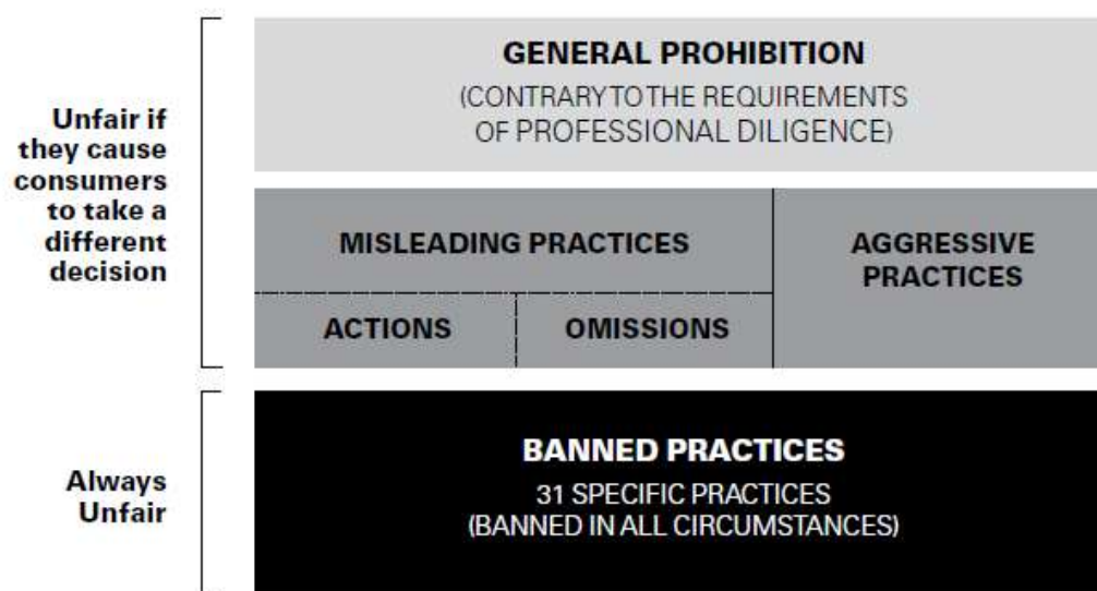
FIGURE 1: Unfair Commercial Practices Directive