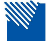
NEW SOUTH WALES IRRIGATORS' COUNCIL