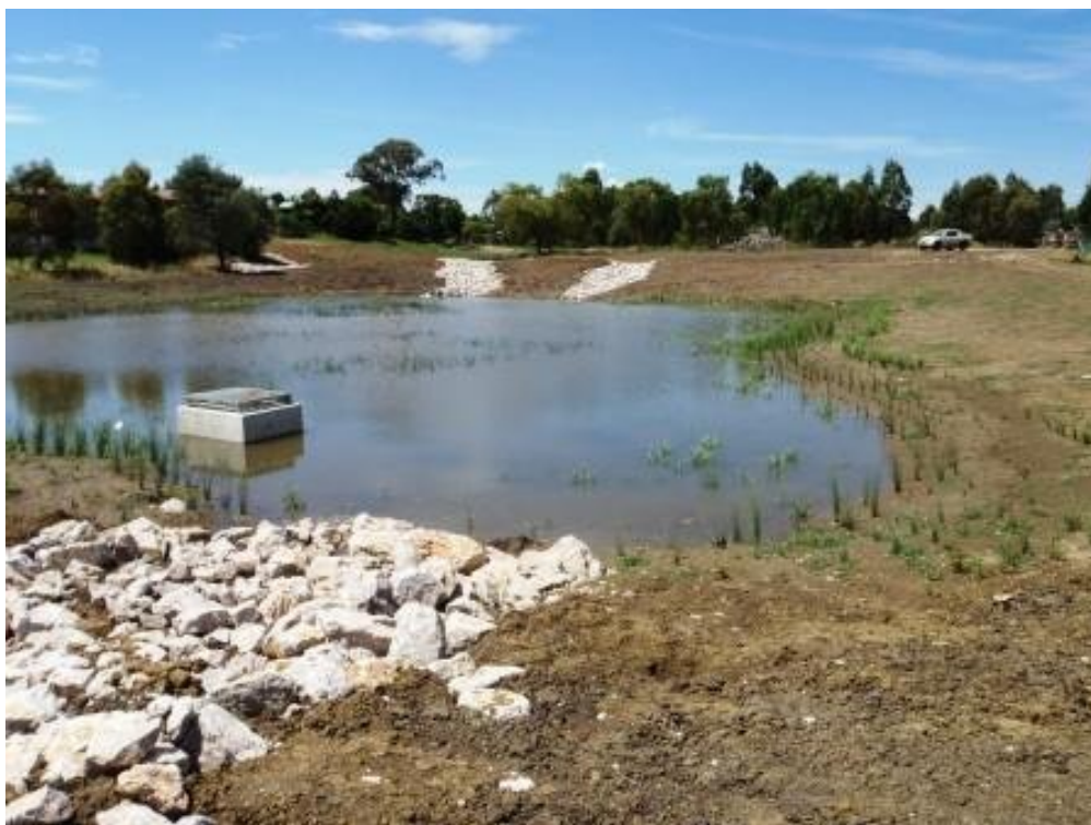
Ploughmans Creek Stormwater Harvesting Scheme

http://www.orange.nsw.gov.au/site/index.cfm?display=158554