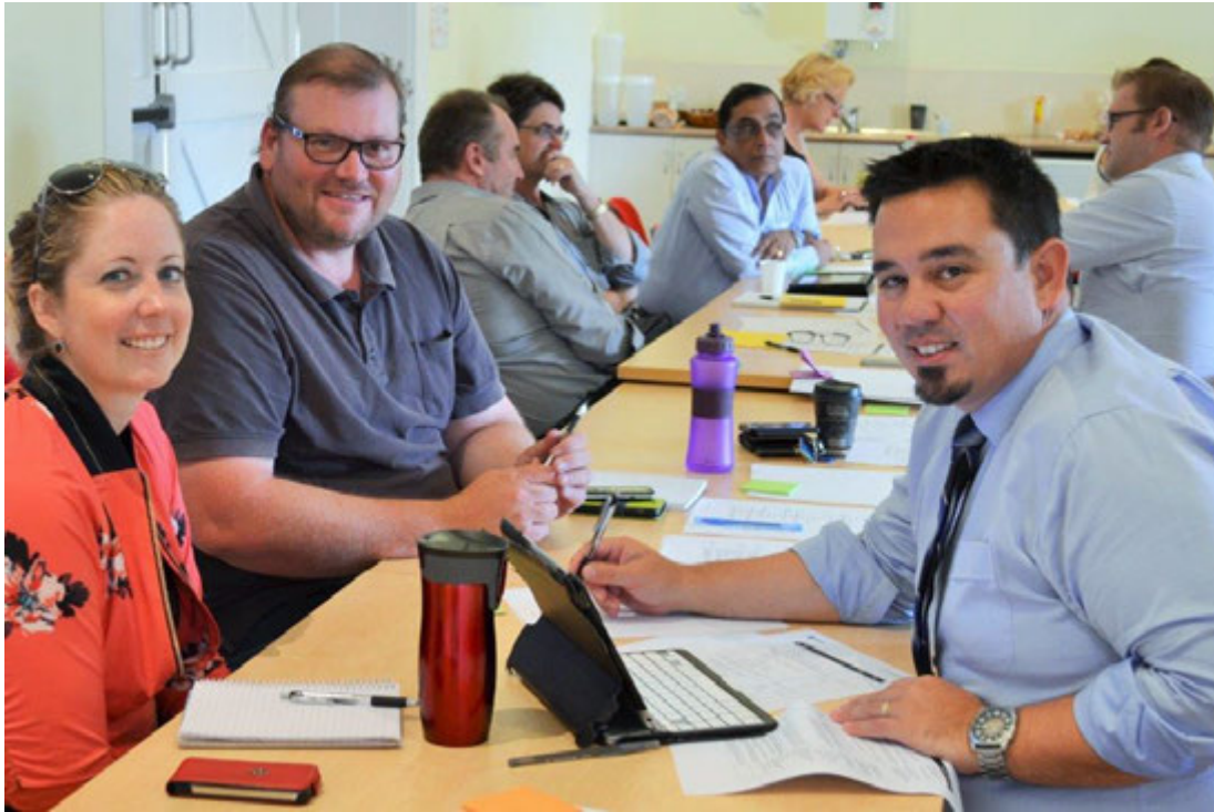
CWUA members -Water Loss Management Workshop- March 2015