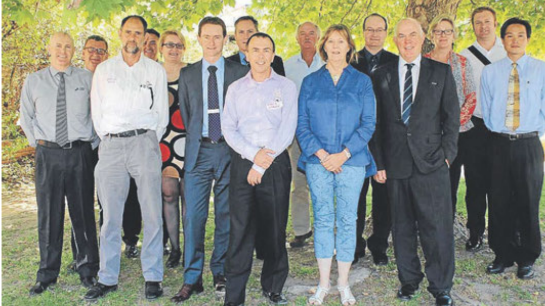
Centroc representatives meet with State Water on scoping for a new storage- Forbes November 2014

Centroc has advocated for a regional water planning framework that takes into consideration water supply and demand options for the Local Water Utilities (LWUs) across the catchment and most importantly that aligns Local, Regional, State and Federal planning processes. Greater alignment of planning processes at the regional level will deliver optimal outcomes for our communities including an appropriate balance of socio-economic and environmental water needs and good value investment by Government in infrastructure.