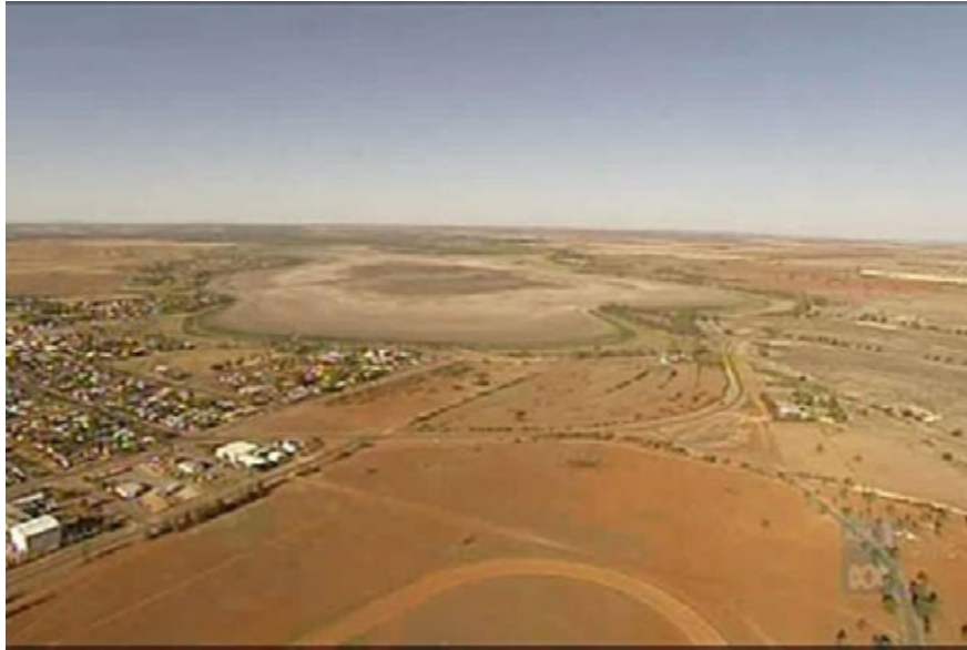
Lake Cargelligo in the grip of the Millennium Drought

http://www.centroc.com.au/publications/water-infrastructure/