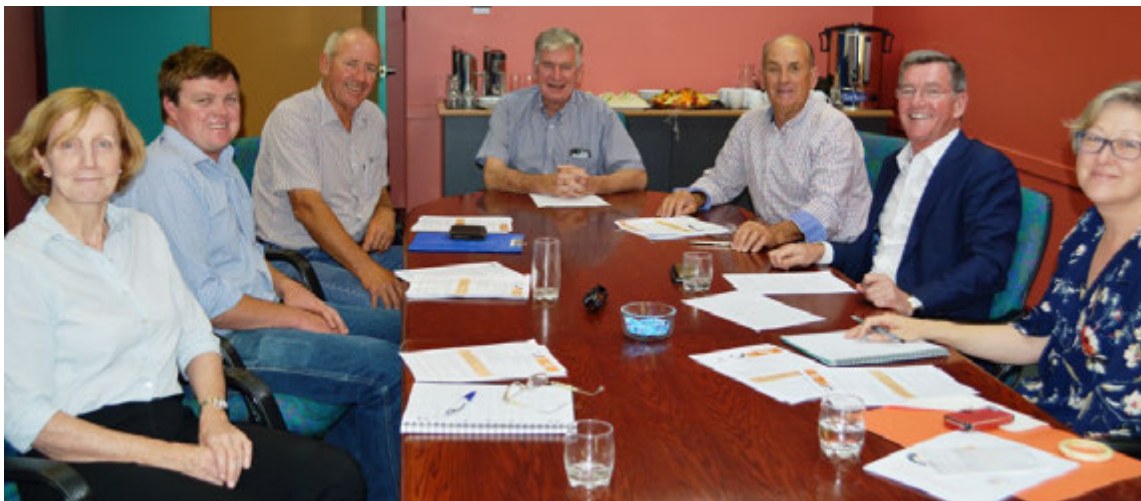
Meeting of Centroc, Lachlan Valley Water and the Belubula Landholders Association-November 2016

Centroc has a history of working collaboratively with key stakeholders across the catchment to ensure an appropriate balance is struck between the needs of towns, industry, agriculture and the environment re-affirming its shared position on water resource management through a communique with Lachlan Valley Water and the Belubula Landholders Association in November 2016.