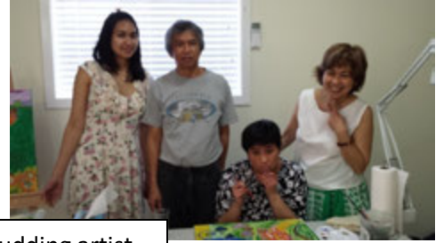
A budding artist.