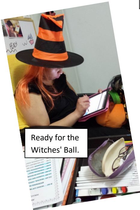
Ready for the Witches' Ball.