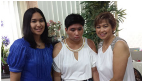
To the Christmas Party!