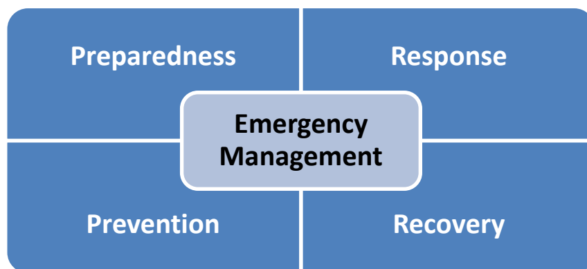
Figure 1 – PPRR model

Emergency management in Australia is based on the concept of Prevention, Preparedness, Response and Recovery (commonly known as the 'PPRR' framework) ( Figure 1 ). Since 2002, Australian governments have promoted a deliberate shift from the traditional focus on response and recovery, to prevention and preparedness.