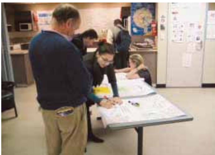
▲ Getting the views of homeless people. The NSW Homeless Persons Legal Service was one of many CLCs that made a submission to the Australian Government's Green Paper on Homelessness earlier in 2008. The HPLS held a number of meetings with people experiencing homelessness to get their views on what the government should do to address the problem.