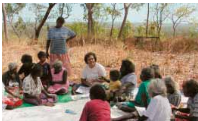
▲ Darwin Community Legal Service Indigenous Aged/Disability Advocates delivering advocacy skills workshop at Wadeye in the NT.

The community-focused cooperative and consultative framework of CLC service delivery is particularly suited to effective work with ATSI communities. CLCs listen to their communities, employ Indigenous workers, learn from the Indigenous peoples' experiences and resource their solutions. Where CLCs identify gaps in service they use their local knowledge and experience to leverage extra resources.