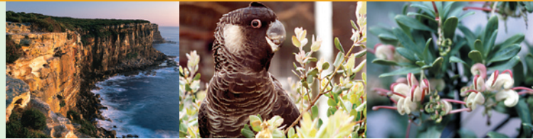
North Head, Carnaby's Black Cockatoo, Wee Jasper Grevillea

The Minister may prepare a plan for a bioregion that is within, or contains, a Commonwealth area. Bioregional plans enable the ecologically sustainable management of biodiversity, heritage and other values.