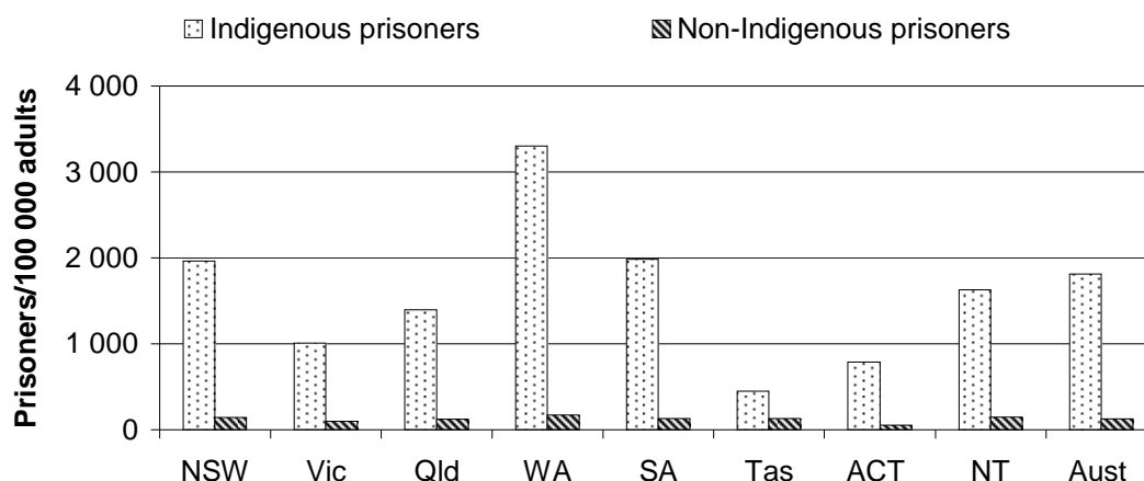
Figure 8.2 Indigenous and non-Indigenous age standardised imprisonment rates, 2009-10 a

a Rates are based on the indirect standardisation method, applying age-group imprisonment rates derived from Prison Census data.