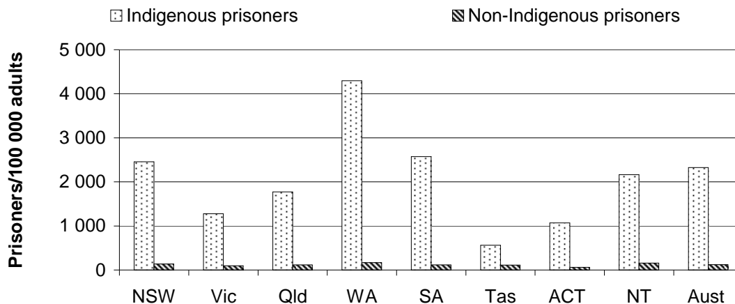
Figure 8.1 Indigenous and non-Indigenous crude imprisonment rates, 2009-10 a, b

a Non-age standardised rates based on the daily average prisoner population numbers supplied by State and Territory governments, calculated against adult Indigenous and non-Indigenous population estimates. b Excludes prisoners whose Indigenous status was reported as unknown.