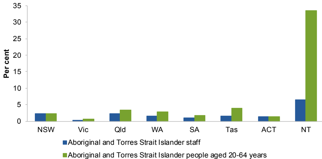
Figure 6.2 Proportions of Aboriginal and Torres Strait Islander staff in 2013-14 and Aboriginal and Torres Strait Islander people aged 20–64 years a, b, c

a Aboriginal and Torres Strait Islander staff numbers relate to those staff who self-identify as being of Aboriginal and Torres Strait Islander descent. b Information on Aboriginal and Torres Strait Islander status is collected generally at the time of recruitment. c Data comprise all full time equivalent (FTE) staff except in the NT, where data are based on a headcount at 30 June.