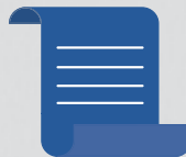
Information + Transparency