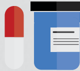
Pharmacy + PBS