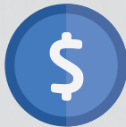
Provider Payment Models