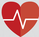
Private Health Insurance